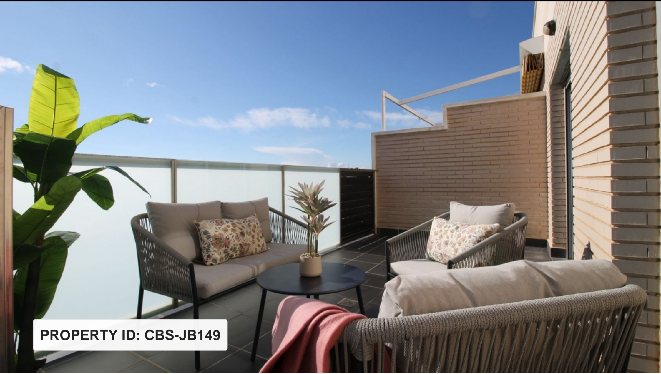
PROPERTY ID: CBS-JB149